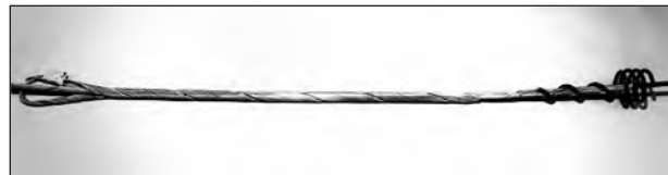
Used with a FIBERLIGN® Dielectric Dead-end