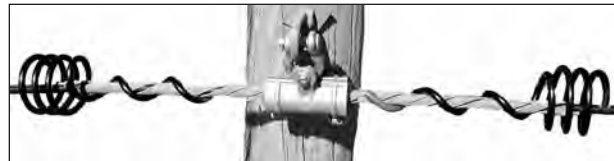
Used with a FIBERLIGN® Aluminum Suspension w/rods