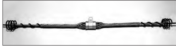
Used with a FIBERLIGN® Dielectric Suspension