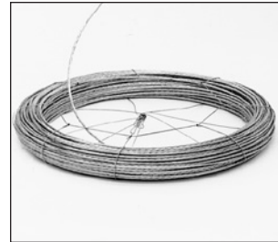
4. Turn wire cage over and pay-out from side. Tuck end back into the cage.