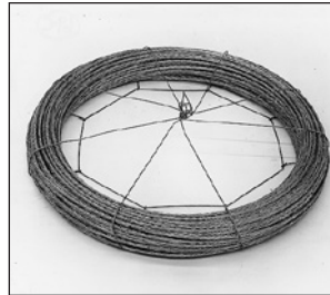
3. Twist at least two inches of legs together until wire cage is tight.