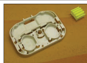
8004034 COYOTE Splice Tray Kit