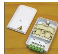
COYOTE ACE with 5 SC Adapters