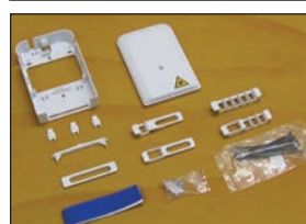
COYOTE ACE Splice Tray Kit