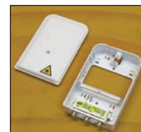
COYOTE ACE 1x3 Coax Splitter