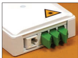
CAT5 / Fiber Connection