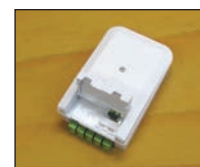
COYOTE Fiber Wall Plate Mounted to COYOTE ACE