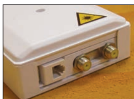
CAT5 / Coax Connection