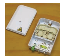
COYOTE ACE with 1 SC Adapter and 1x2 Coax Splitter