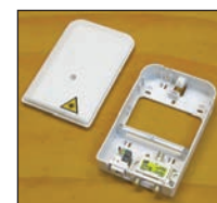
COYOTE ACE 1 Ethernet Adapter and 1x2 Coax Splitter