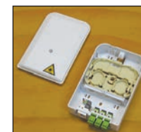
COYOTE ACE with 3 SC Adapters and 1 Ethernet Adapter