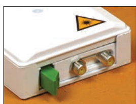
Coax / SC Fiber Connection