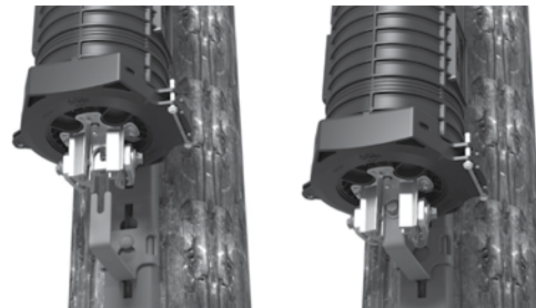
CRB engages Mounting Adapter