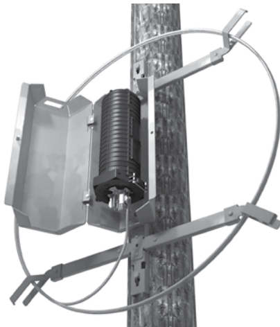
CRB System including Defender 2 and Cable Storage 2