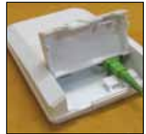
COYOTE Fiber Wall Plate Access Door