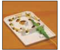
COYOTE Fiber Wall Plate Base