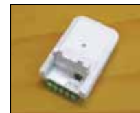
COYOTE Fiber Wall Plate Mounted to COYOTE ACE