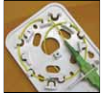
Pigtail Storage in COYOTE Fiber Wall Plate