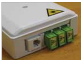
CAT5 / Fiber Connection