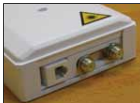
CAT5 / Coax Connection