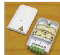
COYOTE ACE with 5 SC Adapters