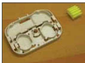
8004034 COYOTE Splice Tray Kit