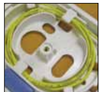
Pigtail Storage in COYOTE Splice and Store Fiber Wall Plate