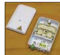
COYOTE ACE with 1 SC Adapter and 1x2 Coax Splitter