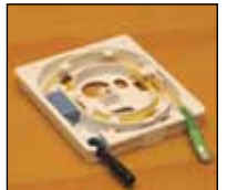
COYOTE Splice and Store Fiber Wall Plate Base