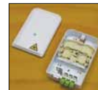
COYOTE ACE with 3 SC Adapters and 1 Ethernet Adapter