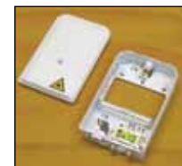
COYOTE ACE 1 Ethernet Adapter and 1x2 Coax Splitter