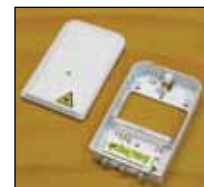
COYOTE ACE 1x3 Coax Splitter