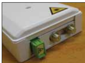
CAT5 / Fiber Connection