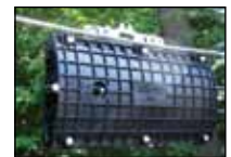
Aerial Strand Mount Bracket