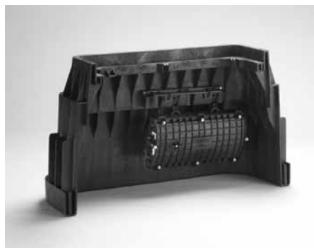
Universal Hand Hole Mount