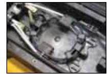
Installed Fiber Organizer for Ribbon