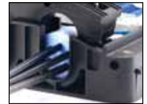
End Plate Installation