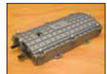
COYOTE Flame Retardant In-Line RUNT