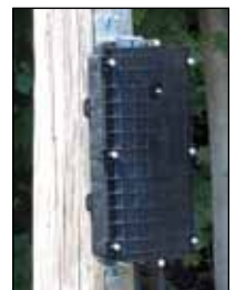
Pole/Wall Mount Bracket