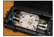
Single Fusion Splice Applications