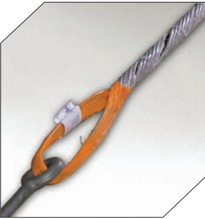
BRACE-GRIP Dead-end systems for Rod