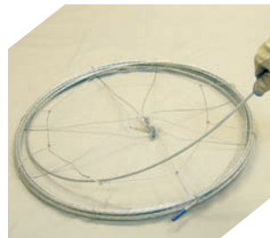
Safety Guy Wire Dispenser

For more information on PLP Bracing Systems, contact PLP.