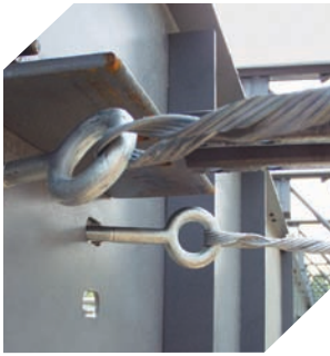
BRACE-GRIP Dead-end systems for Strand