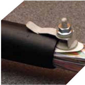
Mini-Moray Shield Connector