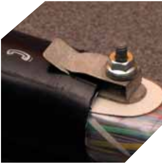
Moray Shield Connector